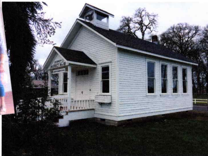
The newly painted Criterion School.